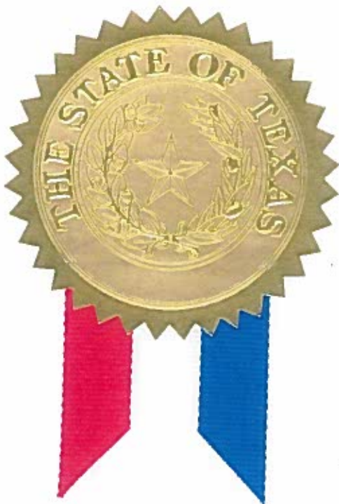
GOVERNOR OF TEXAS

under the laws of the State of Texas with all rights, privileges, and emoluments appertaining to said office. In testimony whereof, I have signed my name and caused the Seal of the State of Texas to be affixed at the City of Austin, this, the 13 th of June, 2018.